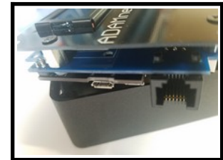
Figure 1: ADE Pro Micro-USB